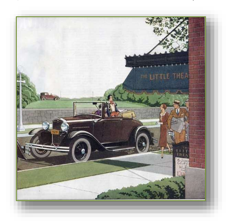
"Perhaps Arriving for 'A Christmas Carol!"